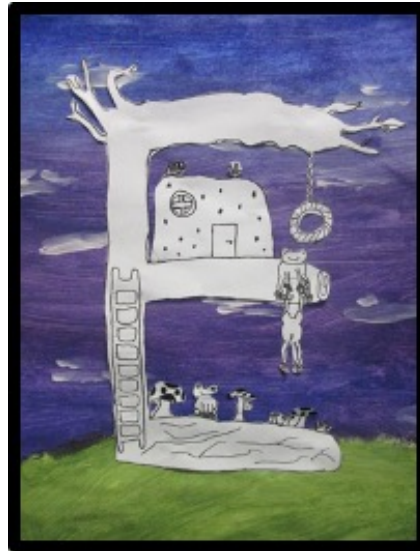
Evelina 6D Creative lettering (letter E)