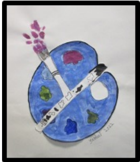
Yashal, 5A Creative lettering (letter Y)