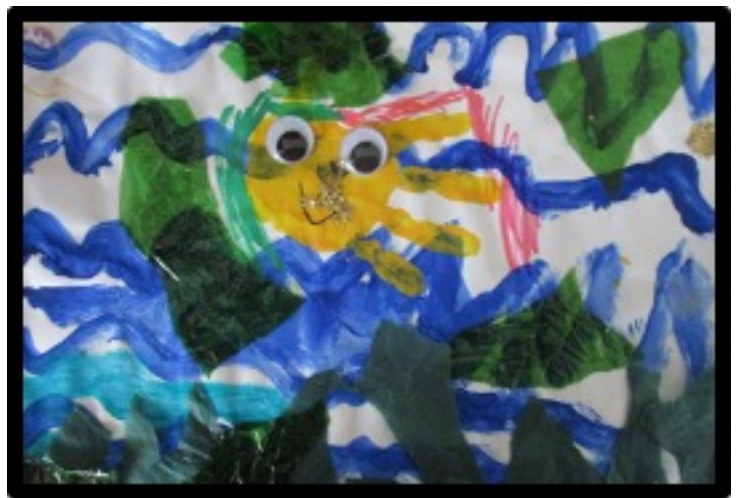
Unmul, Prep B