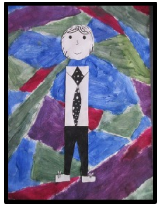
Isabel, 5M Creative lettering / Cool colours (letter i)