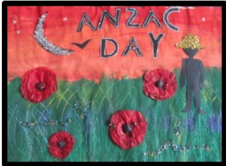
Sana, 4C ANZAC Day