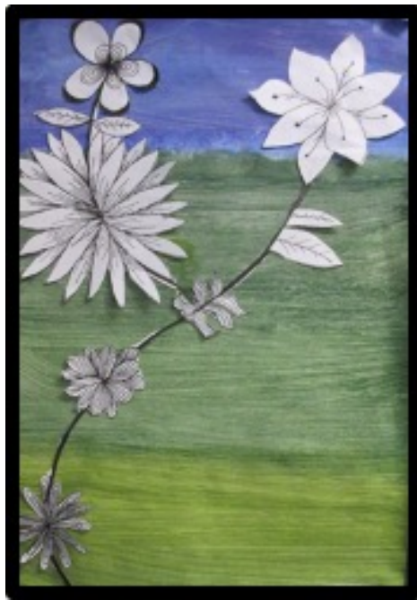
Yasmin, 6D Creative lettering (letter Y)