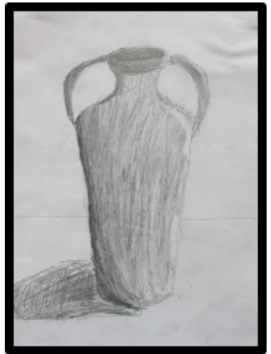
Peter, 5/6W Still life drawing