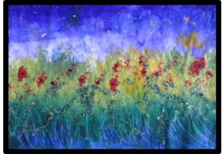
Faramarz, 4H Red poppy field